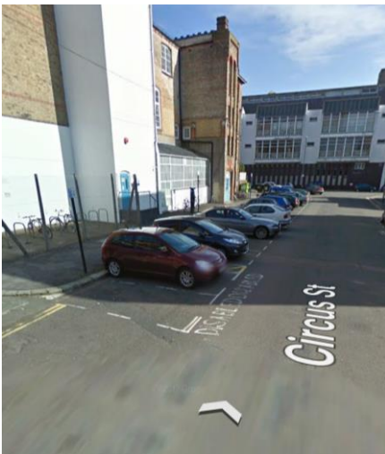
Circus street bays with venue behind