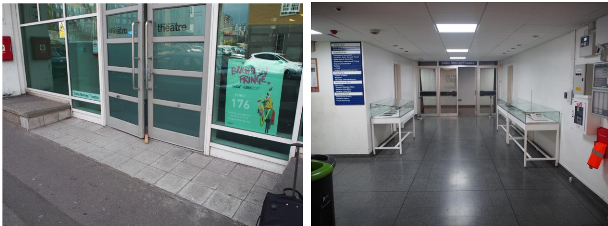
Level-access entrance and foyer area.

The flooring in the foyer areas is smooth tiles.