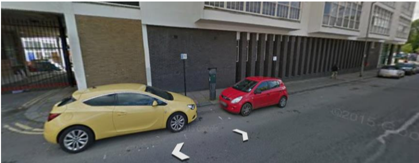
Kingswood Street bay with venue behind

There are 3 blue-badge bays very close to the venue, all with no time limit. One is at the bottom of Kingswood Street alongside the venue, and the other two are at the south end of Circus Street, around a minute's walk away.